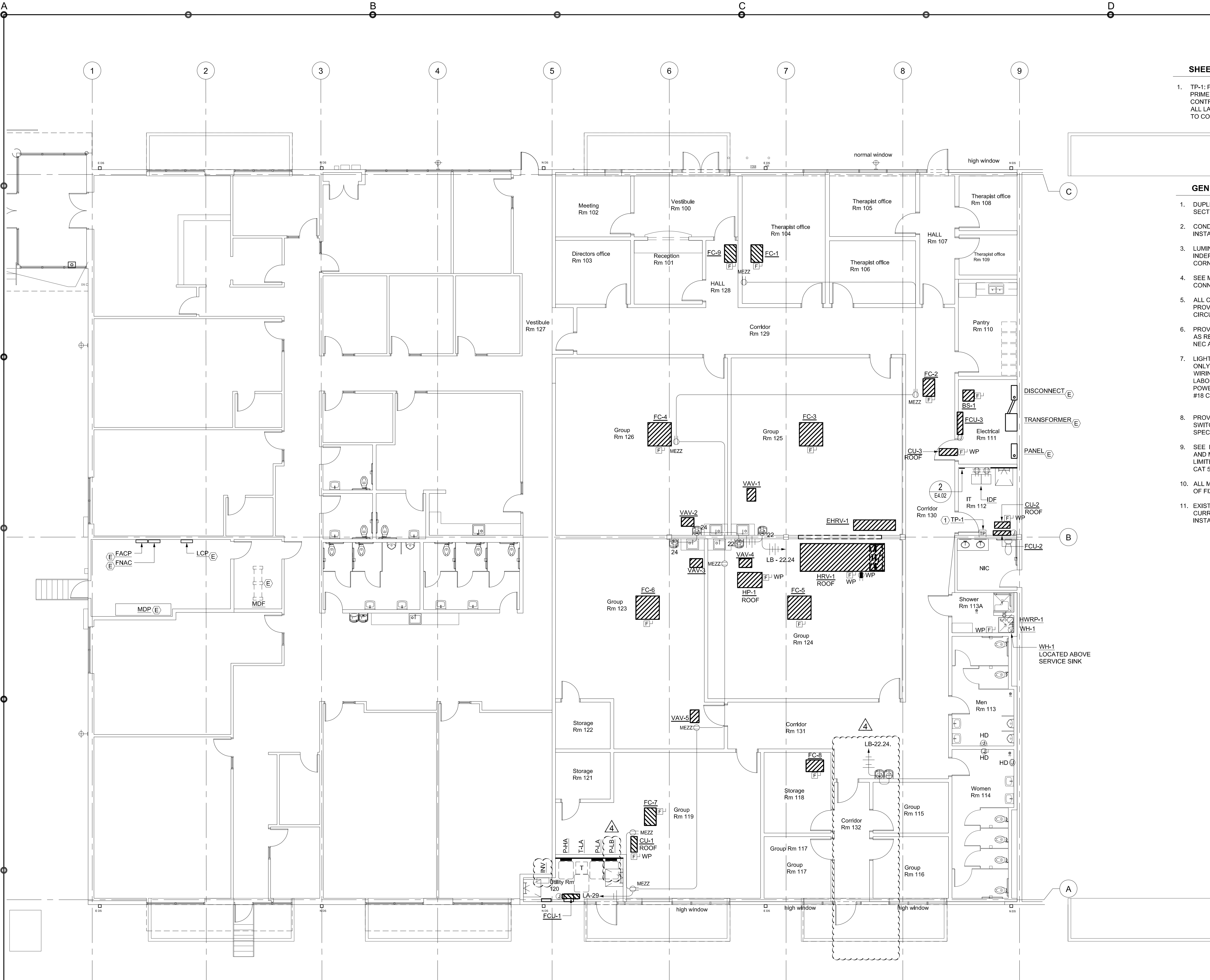
1 New floor plan - Equipment E3.20 Scale 1/8"=1'-0"