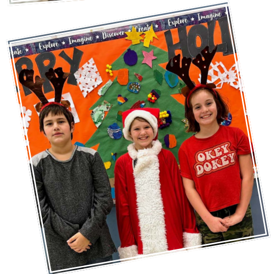
REACH Family Holiday Celebration.

To close out 2023, Dallesport REACH hosted a second annual REACH Family Holiday Celebration which included family portraits and a family dinner followed by hot chocolate & singing carols. In the weeks leading up to the event, students decorated a mural to use as a portrait backdrop & practiced singing carols using song sheets. Over 50 family members showed up to the event, creating a festive & celebratory feel as families headed into winter break.