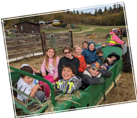
Students enjoying Howard Haven Animal Sanctuary's fall community event.