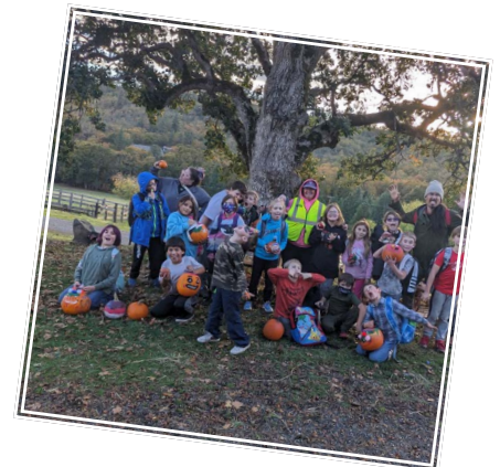
Students engaged with volunteers to paint pumpkins