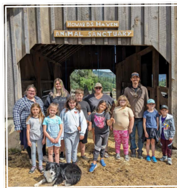
Students visit Howard Haven.