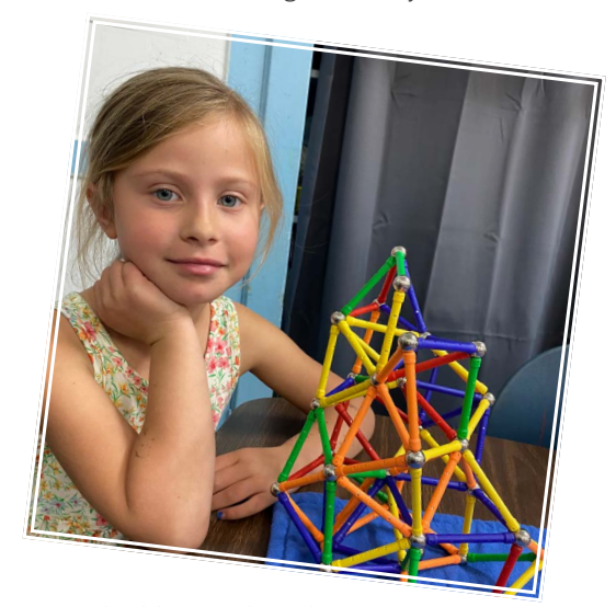
Let's build something fun!