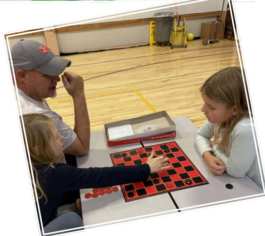
Game night is always fun!