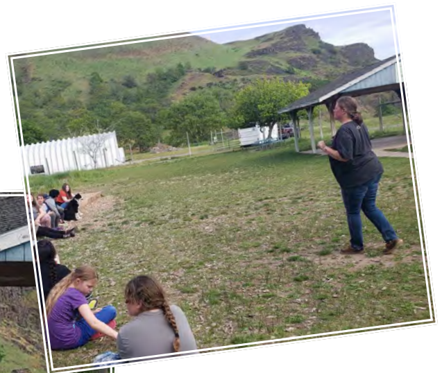
Howards Haven Animal Sanctuary farm to school visit.