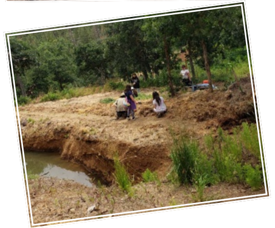
Basalt Blossom Sustainable Farm-Homestead visit.