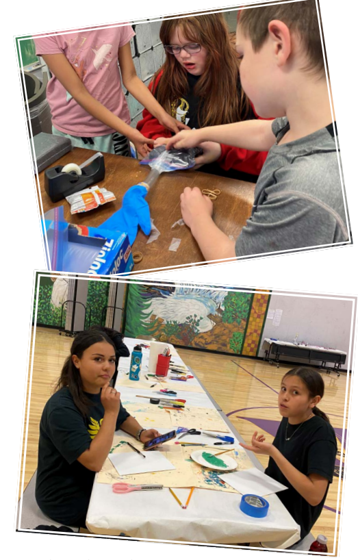
Family night is always a favorite with the students.

We are looking forward to summer program with so many activities, partner visits, and trips to fill our minds and hearts with adventure and the love of learning.