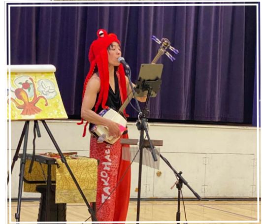
Performing for the kids.