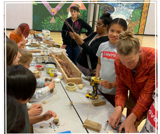
Creating arts and crafts